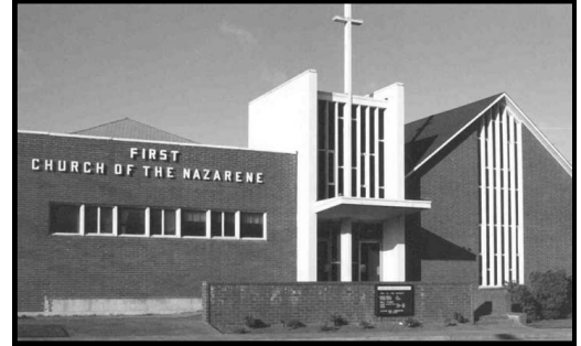
Iglesia del Nazareno Fuente de Vida Organized 2005